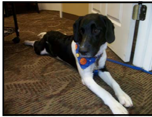
Remi— Recent “Pet of The Week” lounges around the office at Real Estate One of Alpena

If you haven’t made it to one of the meet and greets you should stop in to Real Estate One of Alpena on a Thursday between the hours of